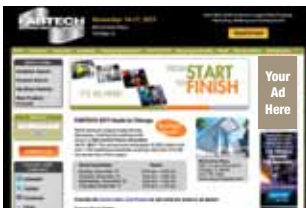
Show Floor Plan