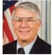
Don Manzullo, Congressman (R-IL)